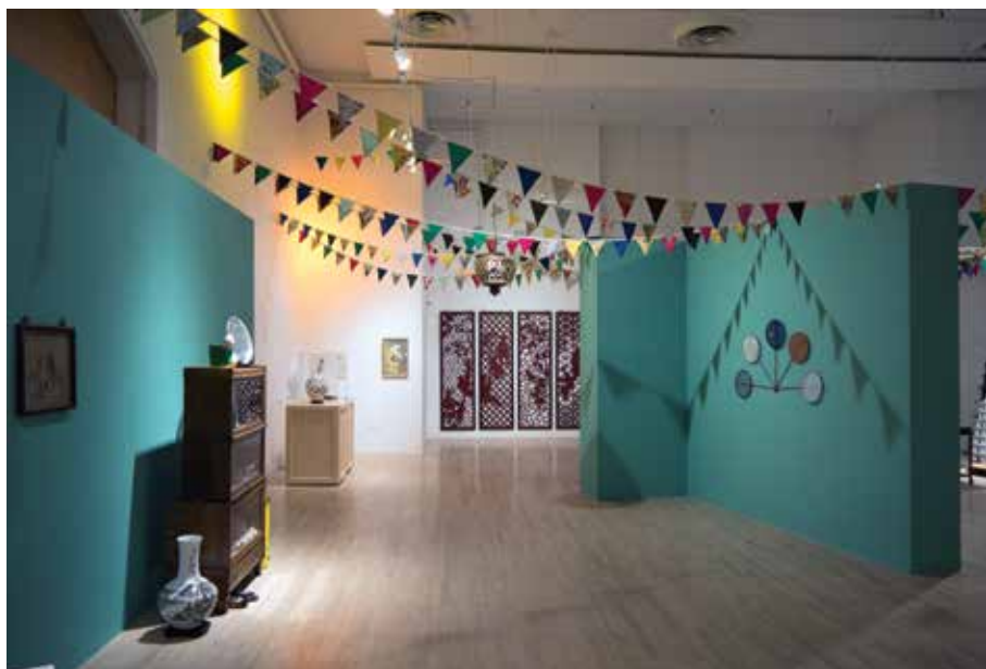
Karen Tam, Nous sommes tous les brigands/We are All Robbers , 2017, installation view, EXPRESSION, Centre d'exposition de Saint-Hyacinthe.

I would be disappointed if my work is received with the same lens of fetishization that perpetuates the Orientalist attitudes that I am critiquing. I hope that there are enough access points in the exhibition for the viewers to enter into a conversation with me or between themselves where they question their own assumptions and do not just accept the museum or exhibition displays and their content at face value.