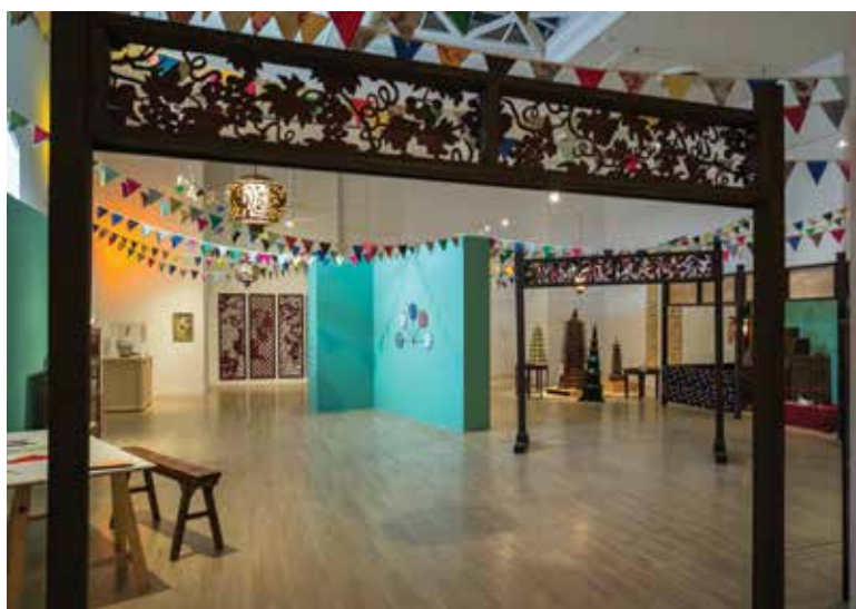
Karen Tam, Nous sommes tous les brigands/We are All Robbers , 2017, installation view with Ornamental Gates , EXPRESSION, Centre d'exposition de Saint-Hyacinthe.

Karen Tam: The series of eleven installation zones within this exhibition were envisioned to allow viewers to wander a similar meandering route that led me to locate the source and story behind the photographs I found in Frankfurt, but also to journey back and forth between the past and present.