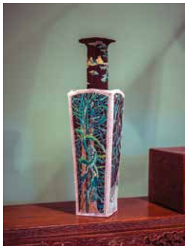
Right: Karen Tam, Nous sommes tous les brigands/We are All Robbers , 2017, installation view with Kiosque des gestes oubliés/Kiosk of Forgotten Gestures (detail), EXPRESSION, Centre d'exposition de Saint-Hyacinthe.